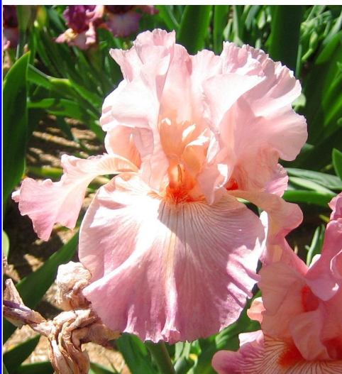
HAMNER AWARD Best In-Region Seedling EDWARDS # 18-24 B