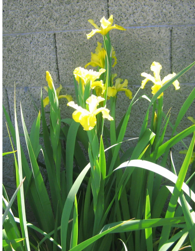
BEST SPURIA LEMON SUNTEA (Cadd 04)