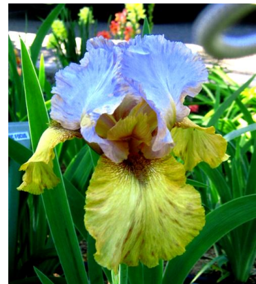
DESERT CELEBRATION (AB)