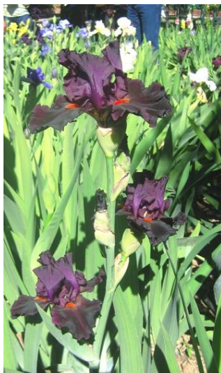
NIGHT MOVES (Lauer 2006)