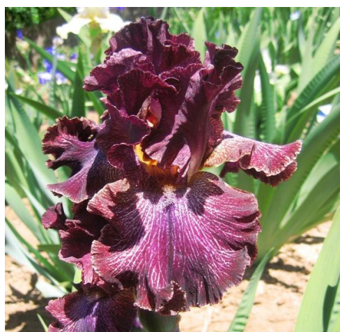
PEP RALLY (Ghio 2008)