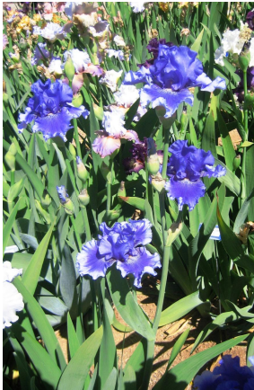
MONEY IN YOUR POCKET (Black 2007)