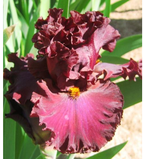
CLAIRE BARR AWARD RED SKIES (Ghio 2007)