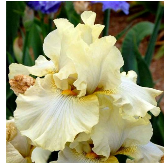
EASY BEING GREEN (Richards 2009)