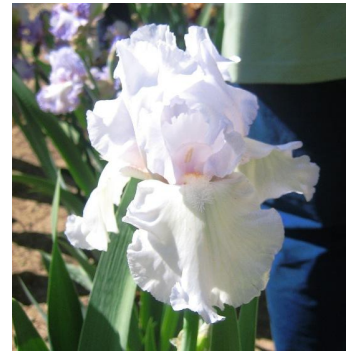
FLIGHT OF FAIRIES (Edwards 2009)