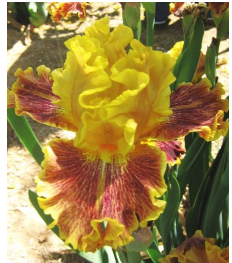
BEST OUT-OF-REGION SEEDLING BAUMUNK # 21-24 N