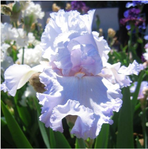
CHRISTMAS PRESENT (Ghio 2007)