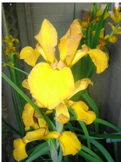
IMPERIAL BRONZE (SPU)