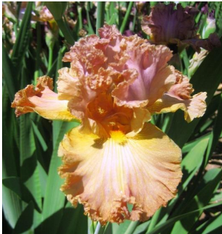
COPPER BUBBLE BATH (Cass 2002)

In lieu of a May meeting, the members had a pot luck on a Saturday evening on May 9th at one member's home. Mother nature accommodated our gathering with mild temperatures, a good time was had by all. There was plenty of great food, including home-made peach ice cream provided by the host.