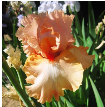
CORAL DANCER (Edwards seedling)