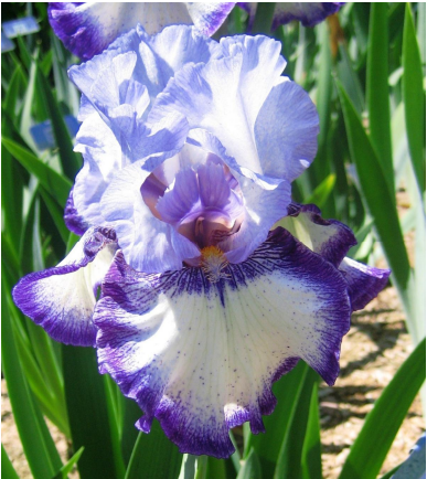
SKY'S THE LIMIT (Valenzuela 2008)