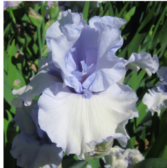
FACE OF AN ANGEL (Black 2007)