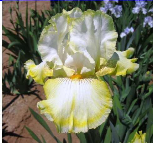
DOUBLE RINGER (Ernst 2007)