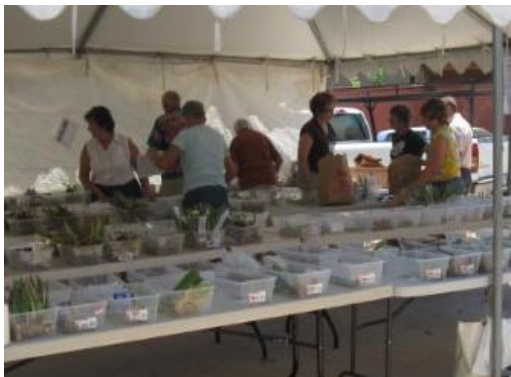
Sale with over 300 varieties