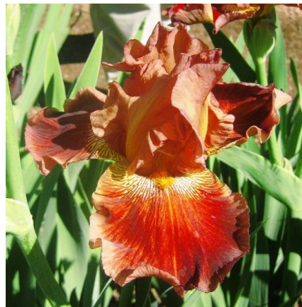
RENEGADE LADY (Deaton 2009)